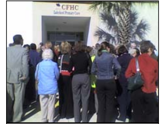
PEACE members celebrate the opening of the Lakeland Primary Care Clinic.

But PEACE's work was not finished. After monitoring the spending, PEACE realized that the money was reaching few people because it was being spent on high-cost specialty care instead of primary care. PEACE engaged in another advocacy campaign and won commitments from the county to open five new primary health clinics in areas of high need. Each clinic will serve up to 40,000 patients a year and will set fees on a sliding scale based on income. The first of the clinics opened in November 2007 and the second is scheduled to open in 2009.